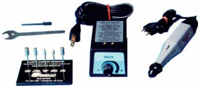
(Micro Delux Machine pictured here with a 5 Diamond Set)

The Lasco Micro Delux machine is light weight, easy to use, and extremely portable. The unit comes complete with a variable speed 110 volt AC table top power controller/converter, a 12 volt DC micro motor handpiece, a shaft restraining pin, and a chuck wrench.