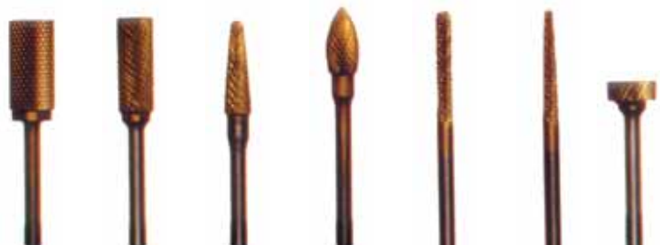
Barrel Small Barrel Cone Football Cylinder Small Cone Wheel Cone